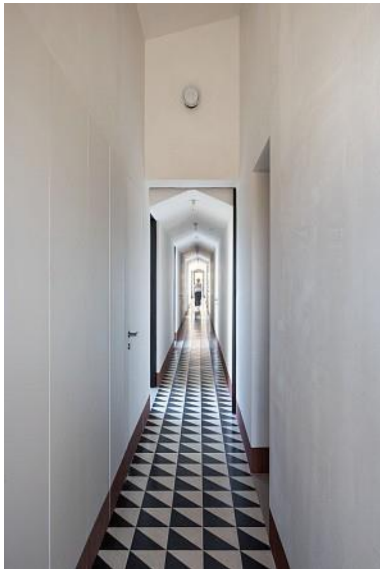
Custom cement tiles for the long corridor equipped with retractable wardrobes where they overlook the rooms; wall lamp Chapeau! by Toscot (above, right). In the bathroom, handcrafted Cotto Etrusco coverings, sink of Flaminia ceramics, Cea Design faucets and shower box Zen by Megius (above, left). The room with opus signinum